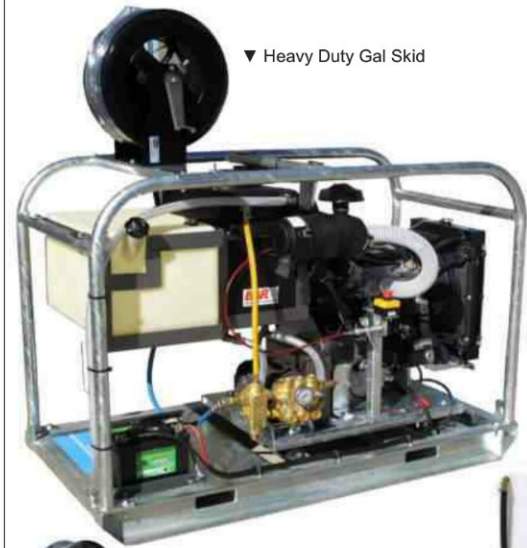
▼ Heavy Duty Gal Skid

BAR1754-HzEB Fire Back Up 1740 Psi / 50 l/min. Hatz Air Cooled with HPP Pump BAR1725-HzEB Fire Back Up 1740 Psi 122 l/min. Hatz Belt - Gal Base Plate