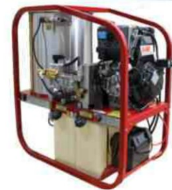
▼ ▲ Hot Water - See hot water section