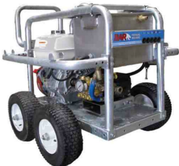
▲ 3013P-HMT (displayed with optional water tank) $4,999