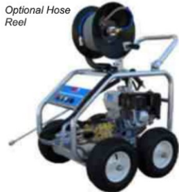
Optional Hose Reel