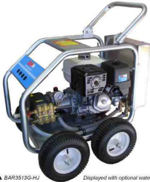
▲ BAR3513G-HJ Displayed with optional water tank