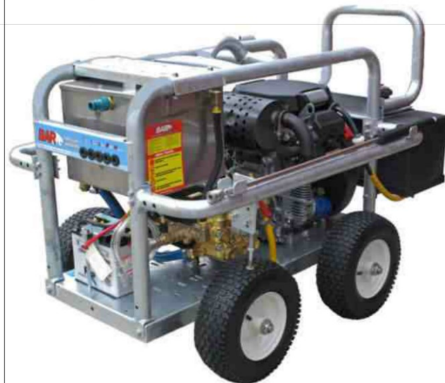
▲ 5027G-HERT (displayed with optional water tank)