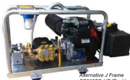
Alternative J Frame BE5027G-HEJT + Hose Reel