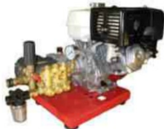
Truck mount option