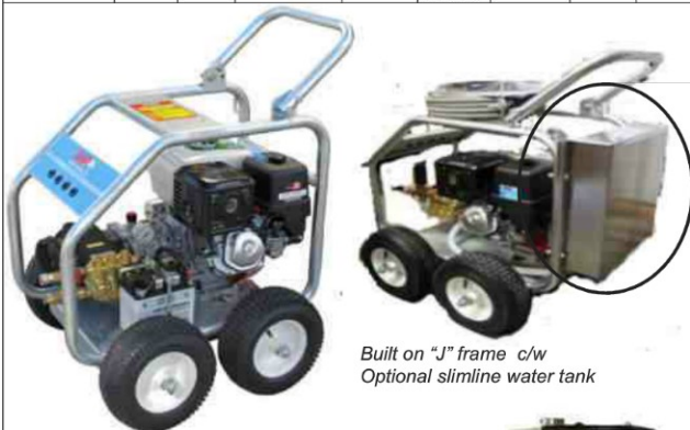
Built on "J" frame c/w Optional slimline water tank