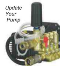
Update Your Pump Full Pump Assembly ZWD4040 Assy $poa